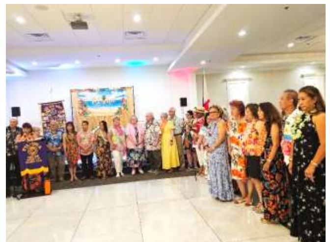
Fil- USA Chicago Lions Club at thier Governor's luncheon.