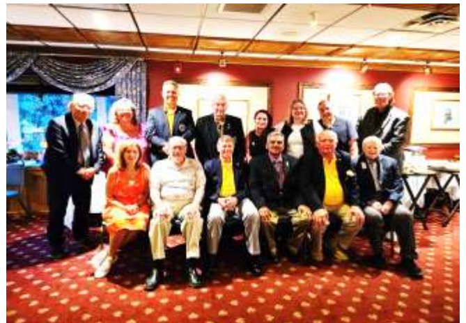
While River Gover Lions missing a few, please say hello to the newly installed officers for our club for the Lions year 2025/2026.